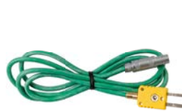
AN 141 Adapter cable, 1m silicone (SMP/Lemo size 0)