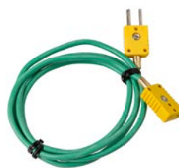
AN 142 Extension cable, 1m silicone, SMP AN 144 Extension cable, 2.5 m, silicone, SMP