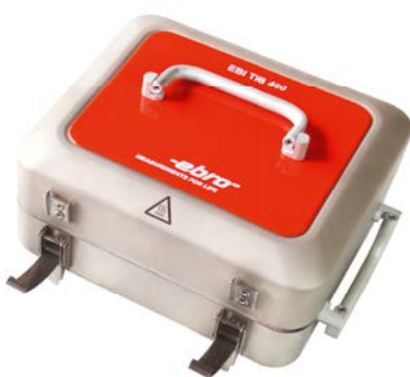
EBI TIB 400-01 Thermal Isolation Box for EBI 40

Sturdy thermal barrier (stainless steel and ceramic)