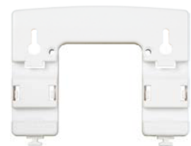
Wall mount EBI 40-WH Bracket for 35 mm cap rail